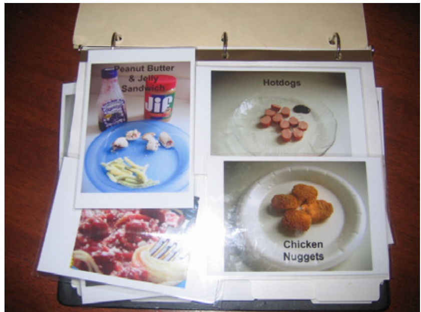
Choose or shoot crisp, clear images of everyday objects. Start with items your child most often relates to, such as the child's favorite foods.

4. Store your PEC System in a clearly marked folder.