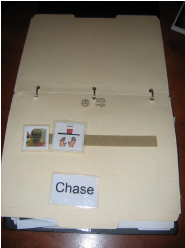
Here we see the opening of a PEC System "sentence" linked on velcro. "Chase.. wants..."